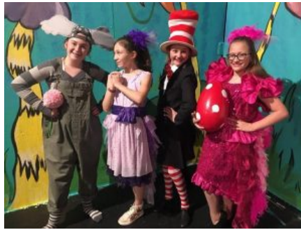
Cast of Seussical the Musical, Jr. at Studio B Performing Arts Center.